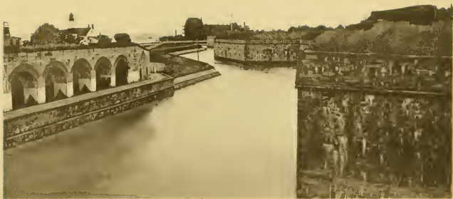
VIEW FROM RAMPARTS, LOOKING WEST.